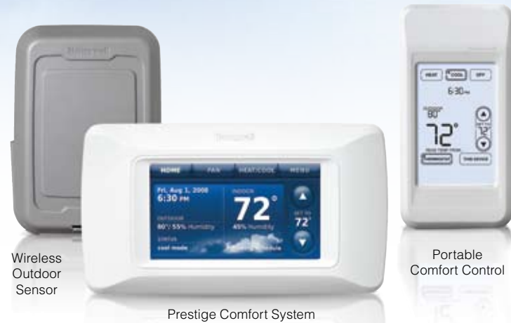
Wireless Outdoor Sensor

For the industry's best contractors that want to set themselves apart, there's Prestige™ Comfort Systems. Prestige is the world's first high-definition, full-color thermostat that redefines how a thermostat can look and what a thermostat can do. There's simply nothing else like it..